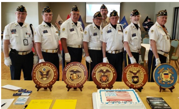
March 15, 2019, was the 100th anniversary of the founding of the American Legion, and Post 64 celebrated after the meeting.