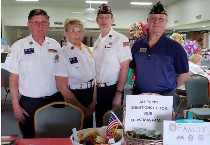
ARC CRAFT FAIR NOVEMBER 17, 2018