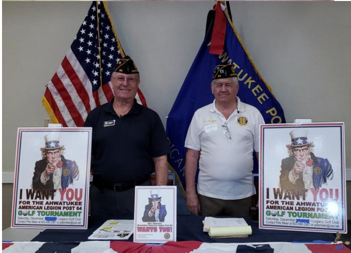
CHAMBER OF COMMERCE SCHOLARSHIP FUNDRAISER AT FOUR POINTS SHERATON NOVEMBER 8, 2018