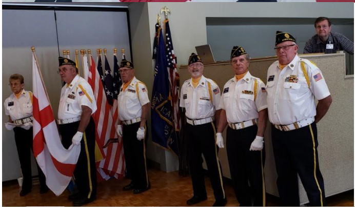
“EVOLUTION OF THE FLAG PROGRAM” PRESENTED TO ARC WOMEN’S CLUB NOVEMBER 12, 2018