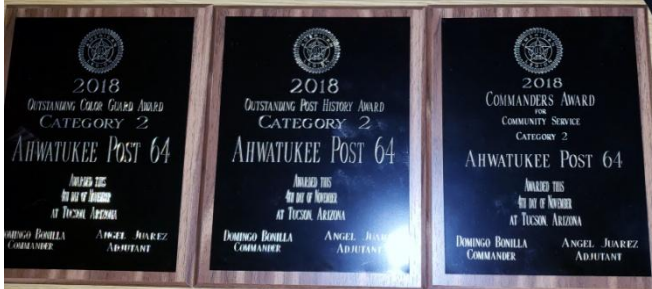
POST AWARDS FOR 2018