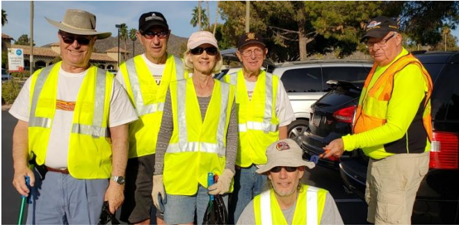
Street Clean-Up March 30