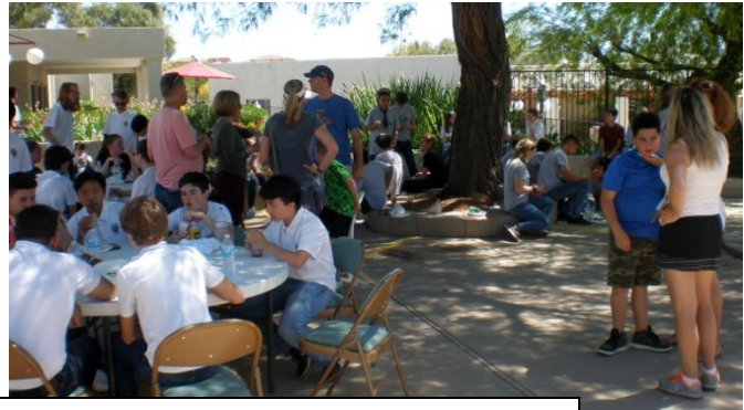
Easter Parade, Hot Dogs, and Concert April 20, 2019