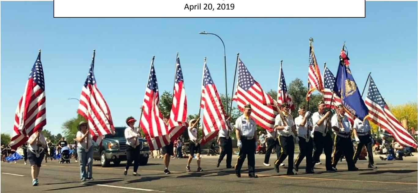
MORE PARADE PICTURES ON THE WEBSITE click here